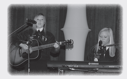
Talent Applications available on State Convention website

Applications and audition videos/CDs are due March 15 to the State FFA Office